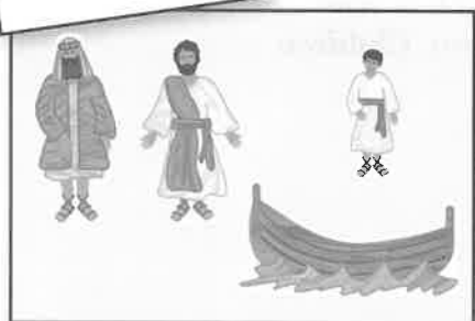
Story Mat with Story Figures 3, 12, 14, 15, and Story Card 8

Punch out any new figures for the lesson and Story Card 8. Lay the story card next to the story mat.