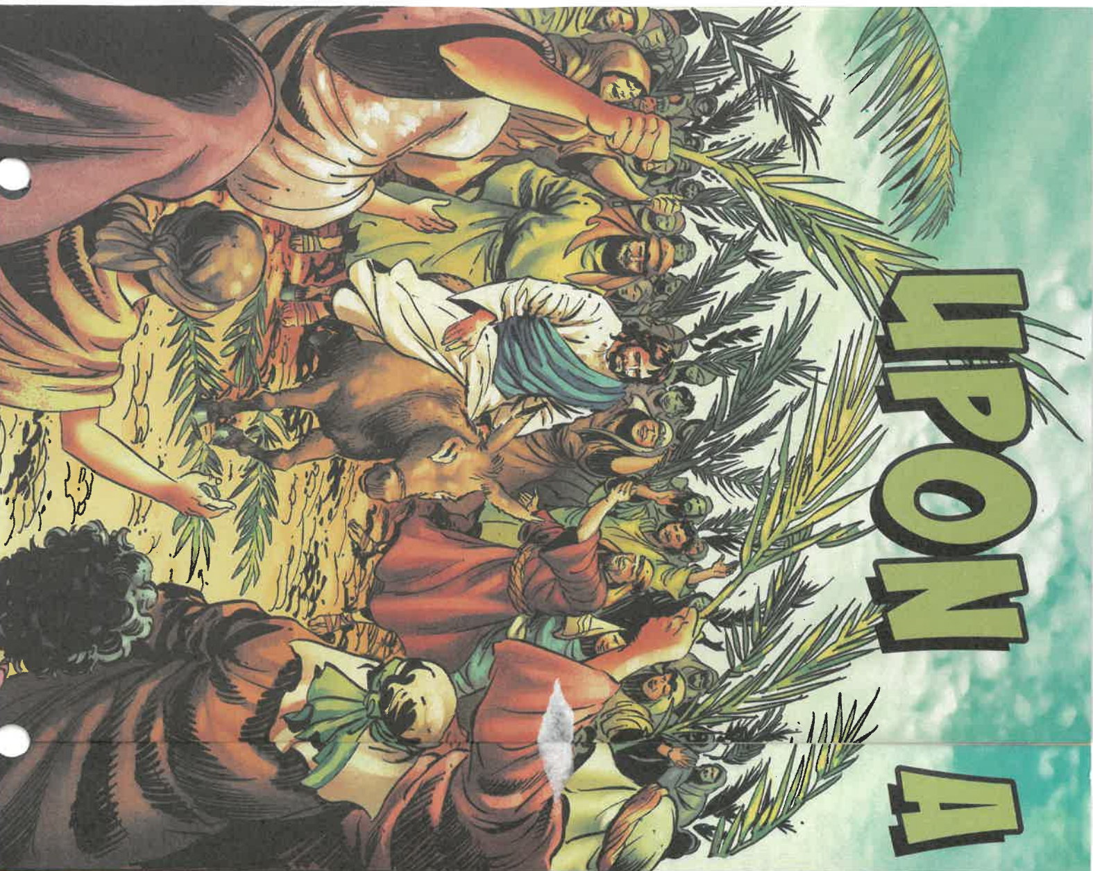
Bible Art © Sergio Carrillo